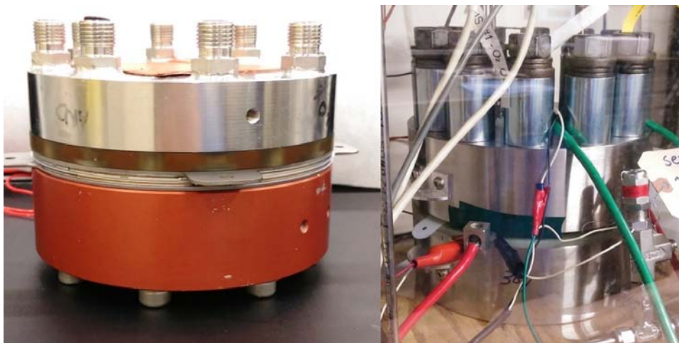
FIGURE 3. Fuel cell stack hardware designed to withstand 350 bar operational pressure

Although the project is still in early stages several conclusions can be drawn.