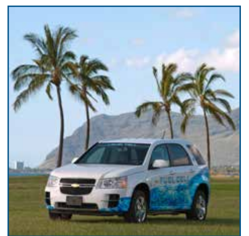
Chevrolet Equinox Fuel Cell Vehicle on Test in Hawaii.

In 2012, several major automakers reaffirmed their commitment to introducing thousands of fuel cell passenger cars within the next few years.