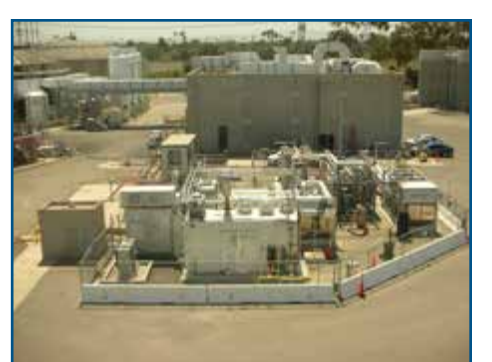
OCSD Energy Park producing heat, power, and hydrogen from anaerobic digester gas.

both the FCTO and SECA. DOE's new ARPA-E program has funded longterm research into biological hydrogen production but the Department's overall investment in the sector remains substantially below its peak. In the areas still