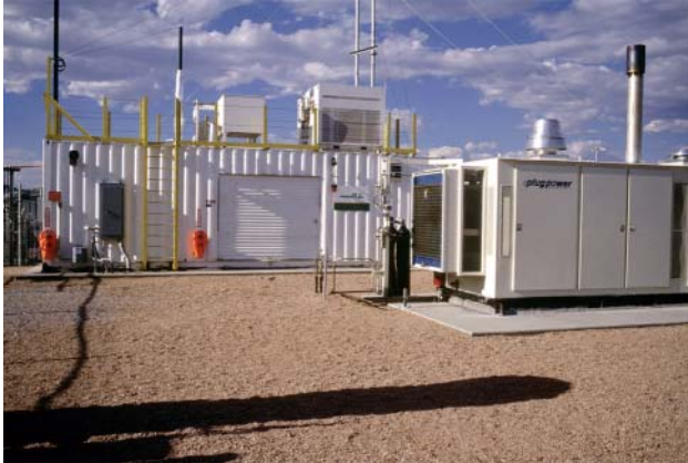
Figure 2. View of the Hydrogen Generator (Left) and Fuel Cell (Right)

Generator system achieved the full range of expected operability control.