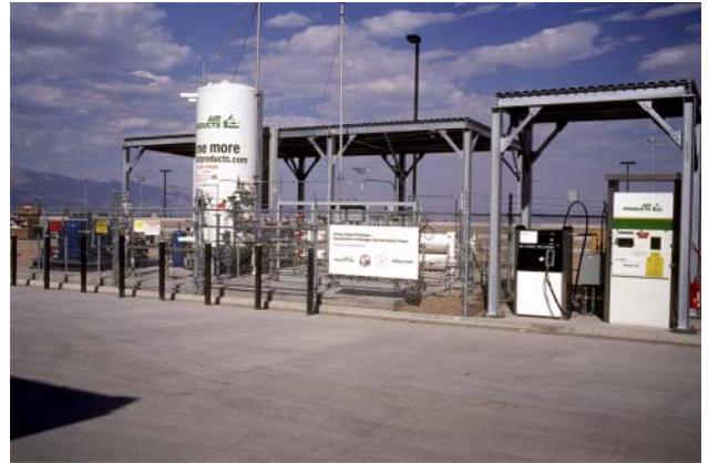
Figure 3. View of the Fuel Station

Economic analysis of the technology was also performed during this period. Based on the economic assumptions provided by the DOE HFCIT Multi-Year Program Plan and the Las Vegas site specific Hydrogen Generator characteristics (lower hydrogen production capacity [150 kg/day, 75 Nm 3 /hr], lower production number of units [1 unit], and more conservative capital factor [10 yr term, 10% DCF]), the test results confirm the ability to meet the $5/kg (GGE) 2003 target for the cost of hydrogen. Further economic analysis was performed to evaluate the integrated co-generation cost of hydrogen and power, with appropriate scaling to economic factors applicable to moderate levels of technology adoption. The analysis was scaled based on higher production capability (400 Nm 3 /hr) and better economies of scale for larger production volume (100 units). The results of this analysis indicate that the technology is capable of achieving an integrated co-generation cost of hydrogen of less than $3.60/kg (GGE) and $0.08/kWh cost of power.