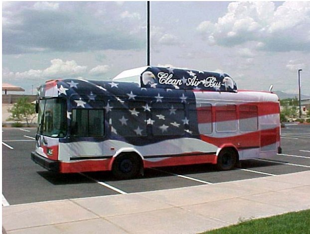
Figure 4. City of Las Vegas Blend Fuel Bus